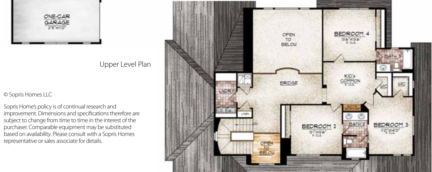
Upper Level Plan