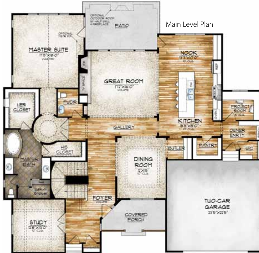
Main Level Plan

Separated by another gracious turret entry is the main floor master suite with two-sided fireplace, patio doors, separate walk-in closets and vanities, curved tub and self contained shower. A practical home center on the main floor, private owners entry with bench, two coat closets and two laundry rooms -- one on the main floor and a second one upstairs -- service to bedrooms on every level. Lifestyle and entertaining allure define this gracious home.